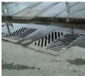
Storm water run-off

Coming this spring, we will be planting about 75 trees at several new affordable housing sites with Sawmill Land Trust and YES Housing, thanks to the generous support of Wells Fargo Bank, Ethicon, and PNM Resources!!!