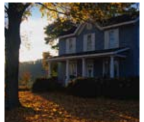
Increased property value